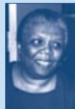
Lucille Clifton March 27 Montante Cultural Center, 8:00 p.m.