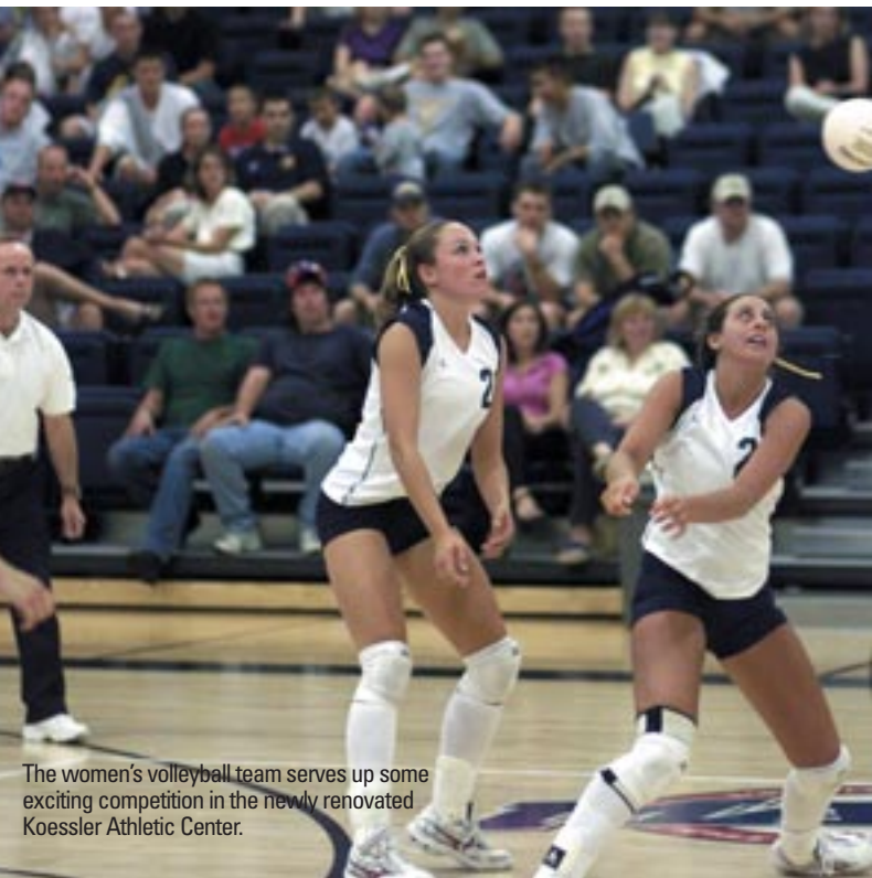
The women's volleyball team serves up some exciting competition in the newly renovated Koessler Athletic Center.