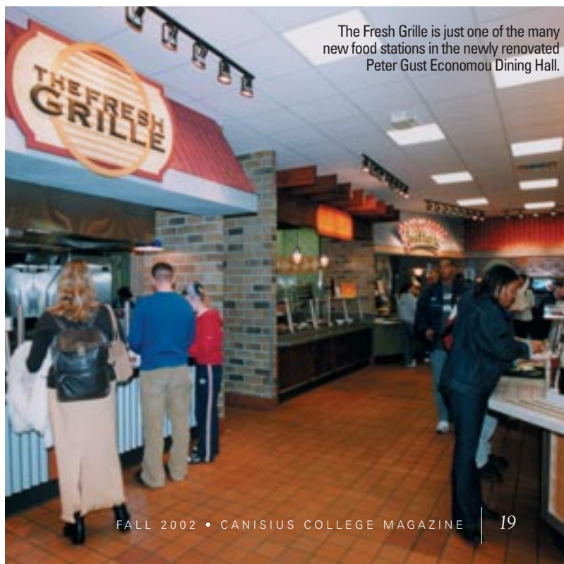
The Fresh Grille is just one of the many new food stations in the newly renovated Peter Gust Economou Dining Hall.