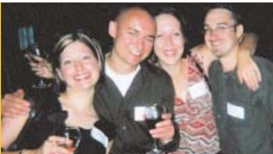
YOUNG ALUMNI NIGHT: More than 90 young alumni attended the Buffalo-Niagara Chapter's Young Alumni happy hour at SoHo, in the city's Chippewa District, on September 13.