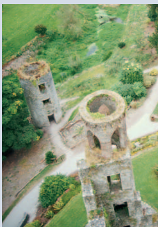
Blarney Castle, Blarney, Ireland