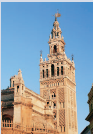
Seville Cathedral, Seville, Spain