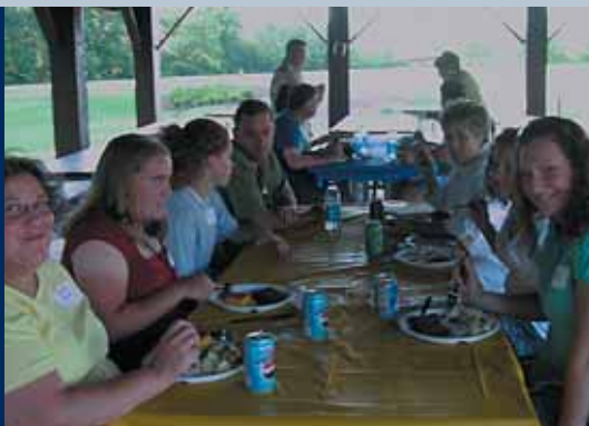
FRESHMEN SEND-OFF PICNIC

PHOTO, LEFT - Central New York alumni and friends send off the newest members of the Canisius community – the Class of 2010 – at their annual Freshmen Send-Off Picnic August 4, 2006.