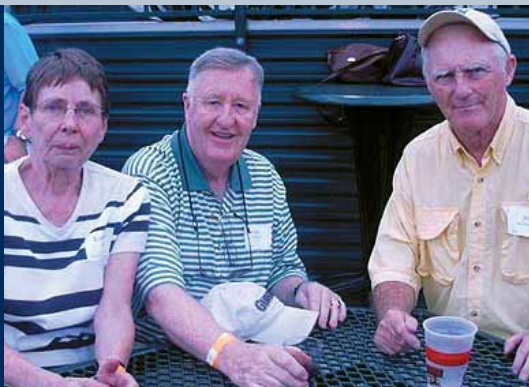
FRIDAY NIGHT BASH Buffalo-Niagara alumni and friends cheered on the Bisons at a Friday Night Bash July 21, 2006.