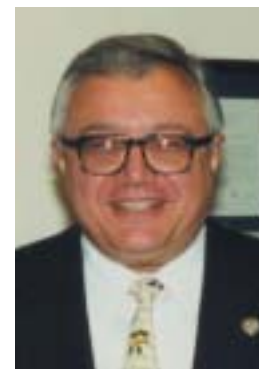
John J. LaFalce '61

LaFalce recently ended a 28-year career as a member of the United States Congress, where he served as the ranking Democrat on the House Financial Services Committee and before that, as chairman of the House Small Business Committee. During his tenure on the hill, LaFalce held hearings on the international competitiveness of United States industry; authored legislation that reformed the Minority Business Set-Aside Program and the Women's Business Opportunity Act, which gave women equal access to credit; led the effort to enact the modernization of financial services laws, with special concern to protecting consumer rights; and sounded the first congressional call