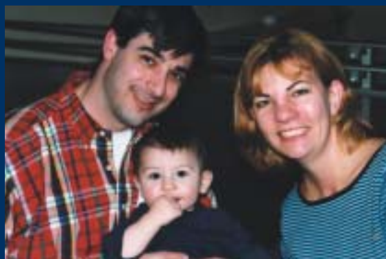
A fine time was had by all, even the youngest Griffs, when the Buffalo Sabres took on the Washington Capitals at the Capital District Alumni Night on February 26, 2003.