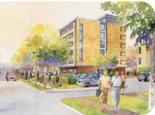
Artist's rendering of the new Eastwood Hall.

Canisius College broke ground on the new Eastwood Hall in April.