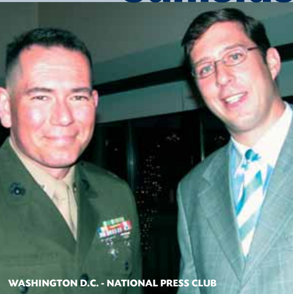
WASHINGTON D.C. - NATIONAL PRESS CLUB