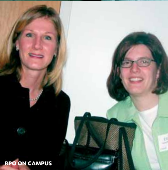
BPO ON CAMPUS