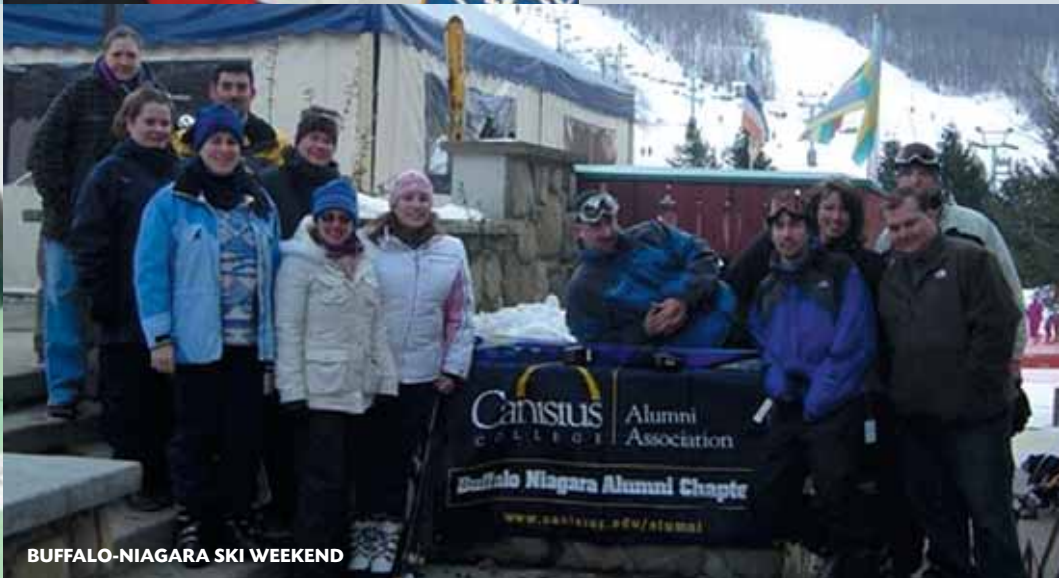
BUFFALO-NIAGARA SKI WEEKEND