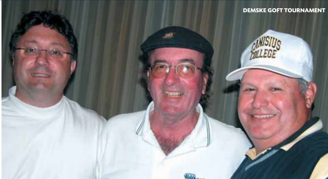
DEMSKE GOFT TOURNAMENT