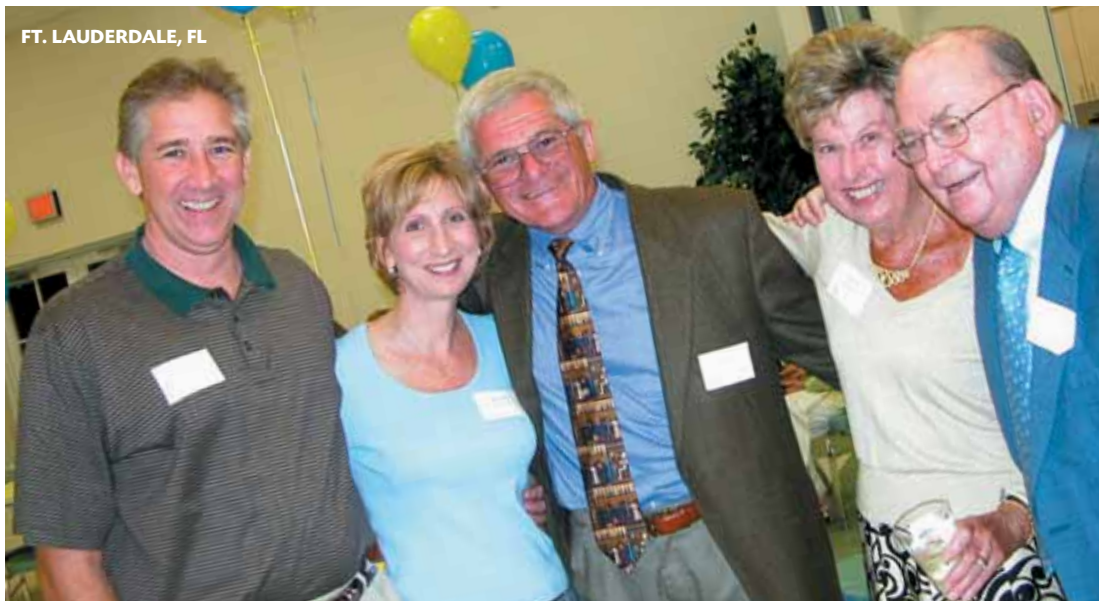
FT. LAUDERDALE, FL