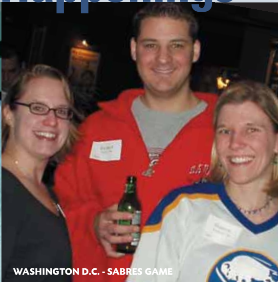
WASHINGTON D.C. - SABRES GAME