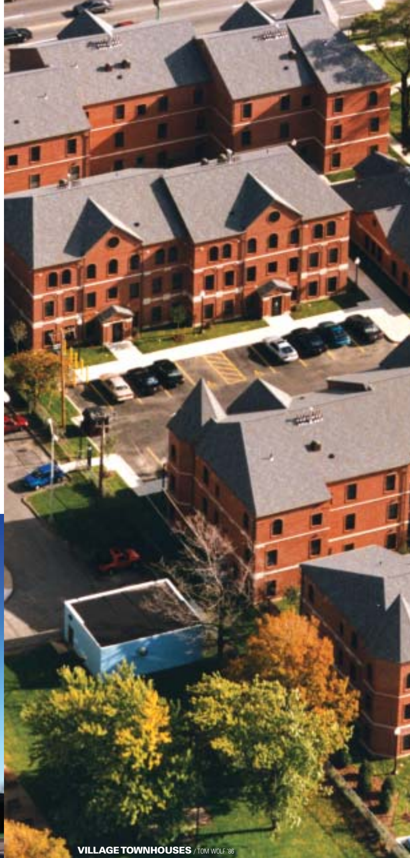
VILLAGE TOWNHOUSES / TOM WOLF '86

and construction: Village Townhouses, Bosch Hall, Frisch Hall, Desmond Hall, George Martin Hall, Delavan Townhouses, Campion Hall. By 1997, the number of freshman resident students surpassed the number of freshman commuter students; a first for Canisius College. Today, the college has 1,418 beds available for students and 100 percent occupancy. Last fall and again this fall, more than 60 percent of freshman students live on campus.