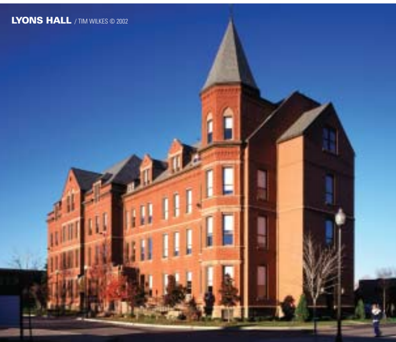
LYONS HALL

September 1993 Canisius purchases St. Vincent de Paul Church and adjacent rectory