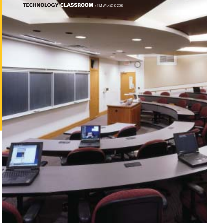
TECHNOLOGY CLASSROOM