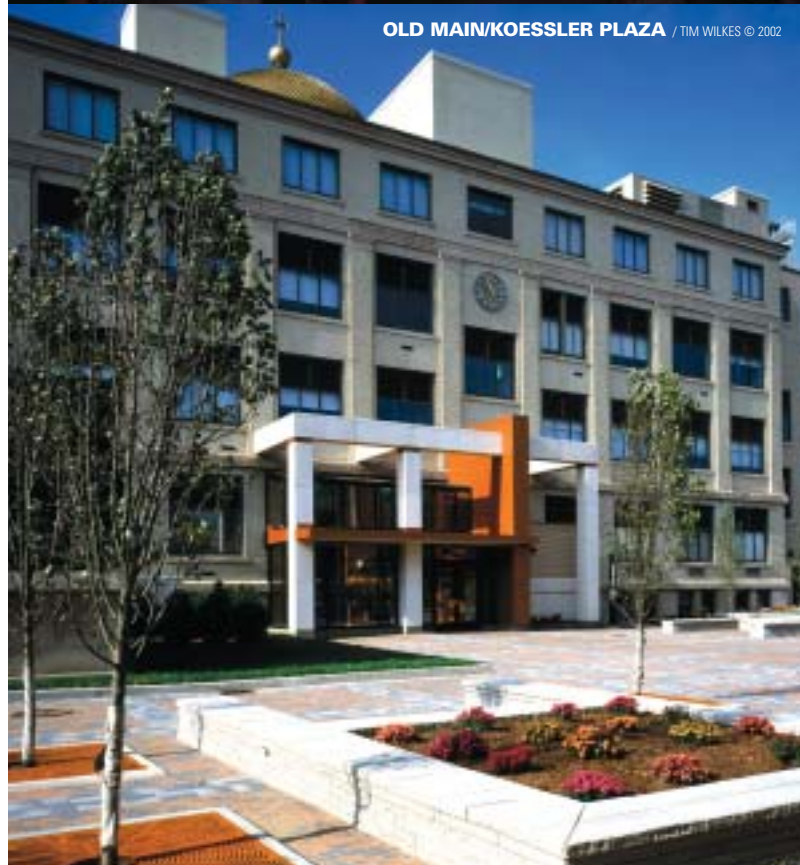
OLD MAIN/KOESSLER PLAZA

October 1999 George M. Martin Hall, the former St. Vincent de Paul Rectory, is dedicated as a new 14-bed residence for students in the All-College Honors Program ($630,000)