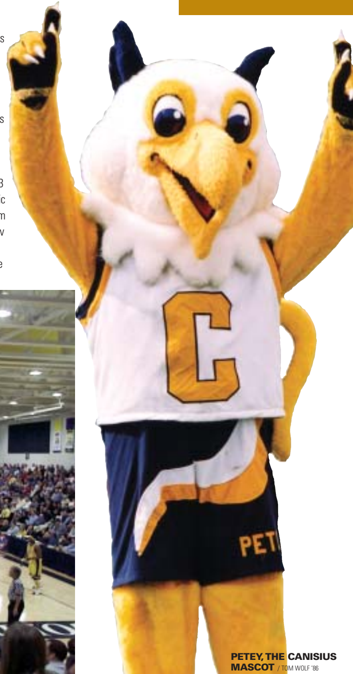
PETEY, THE CANISIUS MASCOT / TOM WOLF '96

The student-athlete GPA has averaged 3.0 or higher since the GRIFFS Life Skills Program was implemented in fall 2000