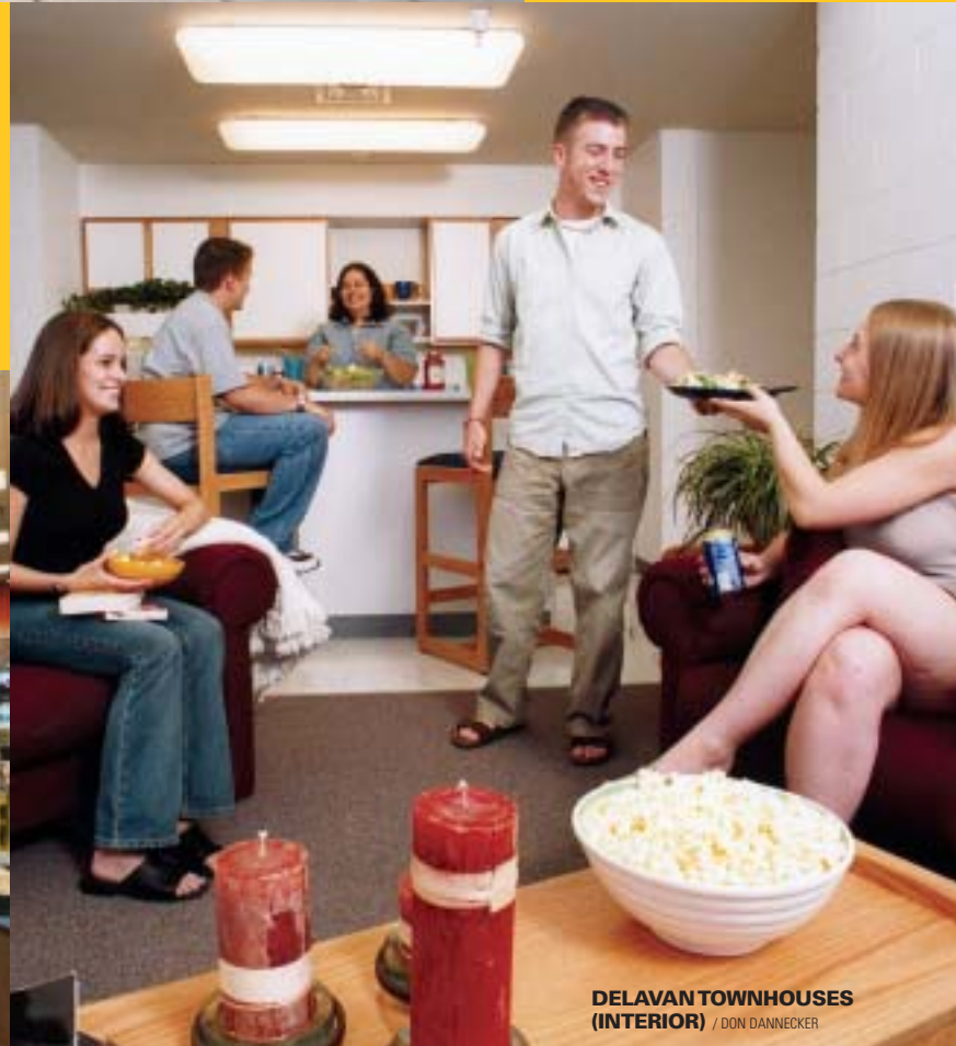
DELANAV TOWNHOUSES (INTERIOR) / DON DANNECKER