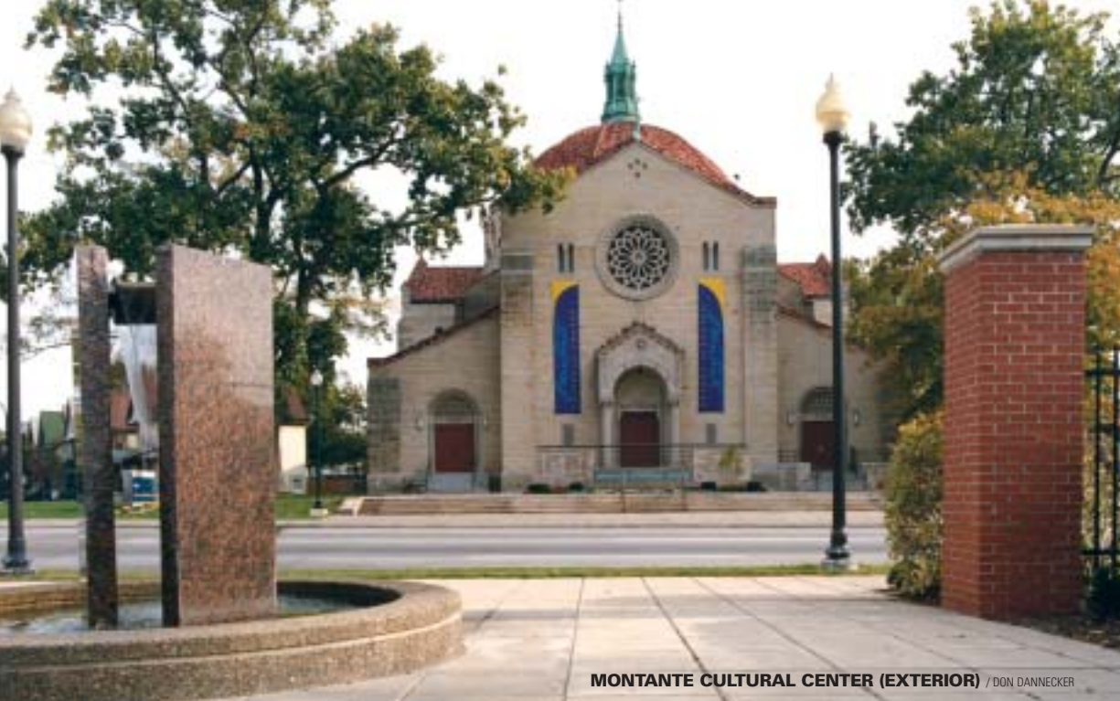
MONTANTE CULTURAL CENTER (EXTERIOR) / DON DANNECKER