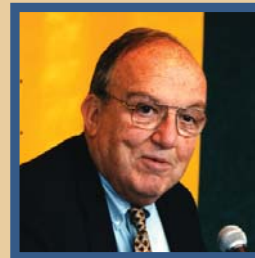
Fay Vincent Jr. Former Major League Baseball Commissioner

UPON RECEIVING THEIR DIPLOMAS IN MAY, the Canisius College Class of 2004 will get one last lesson on leadership and service from former major league baseball commissioner Francis (Fay) T. Vincent Jr. Vincent will present the keynote address at undergraduate commencement ceremonies on May 22, at U.B.'s Alumni Arena.