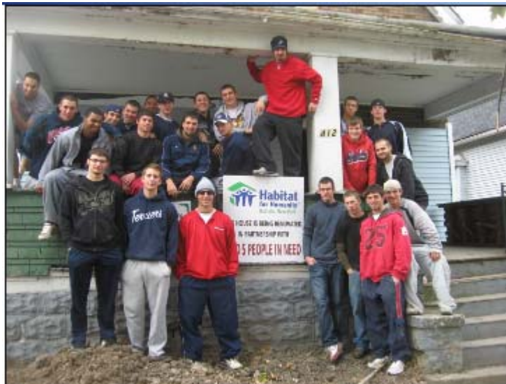
(Women's Soccer at Benedict House and Baseball at Habitat for Humanity Cambridge Avenue Buffalo)