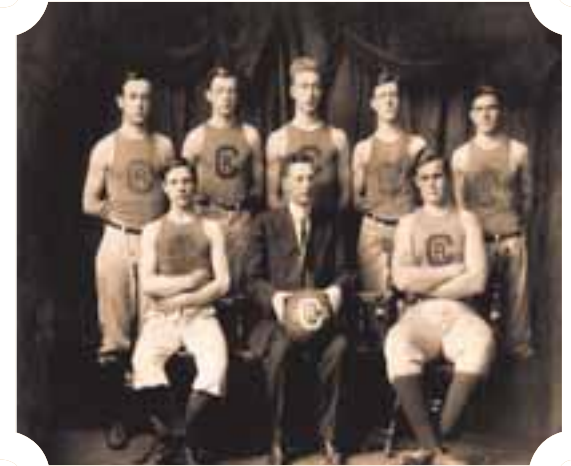
Canisius Basketball Team of 1910-1911

programs from drama productions, materials relating to academic programs offered by the College, photographs of campus grounds and members of the college community (ie sports teams and student organizations).