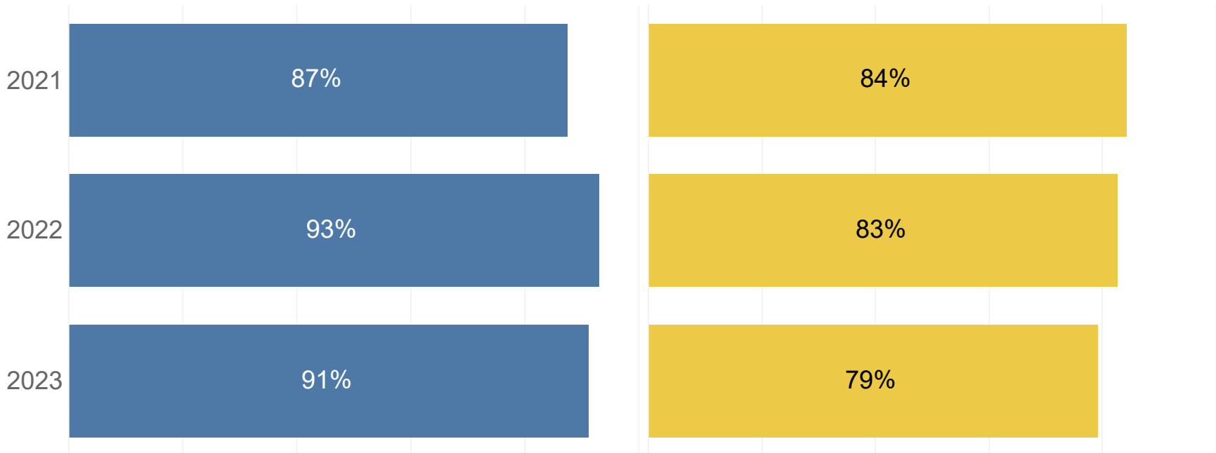
Grads Seeking Graduate/Continuing Education