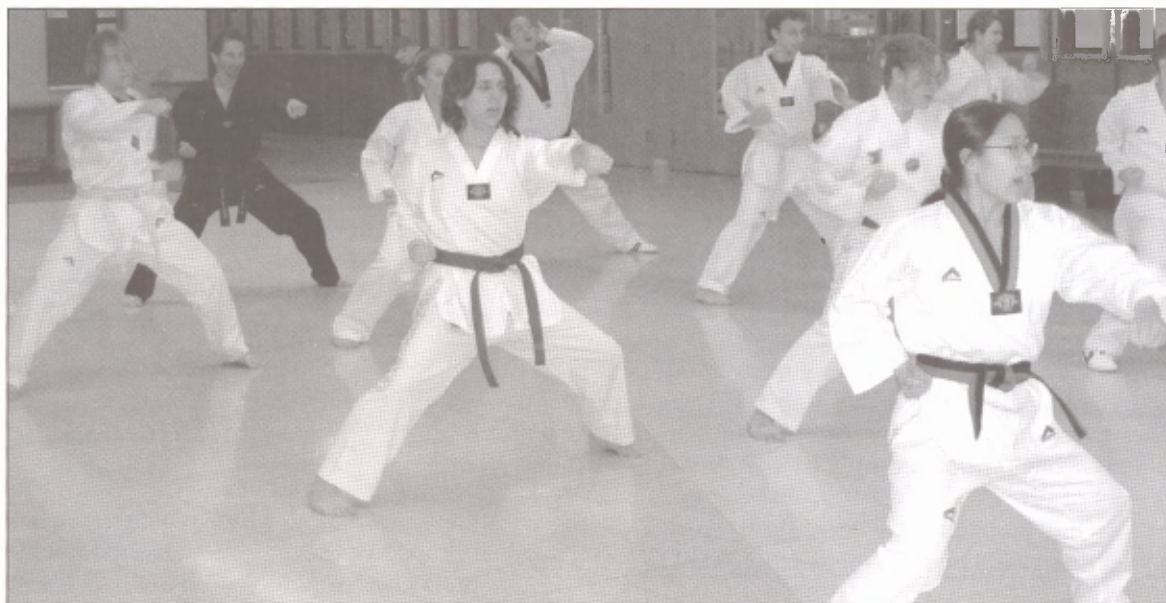
Exercising mind and body at Le Moyne College.

I brood over the suspicion that this educational enterprise might be the dark side of the revolution created by the printing press and the rise of technology. As the late Walter Ong, S.J., often argued, as important as print was in its influence on literacy and education, it also helped to prioritize word based descriptions of the