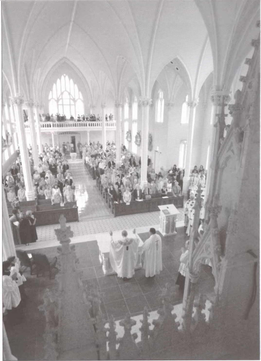
Spring Hill College.

I led a small group of students to the third world.